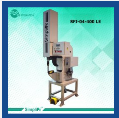
Fastener Insertion Machine