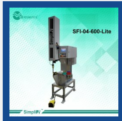
Fastener Insertion Machine