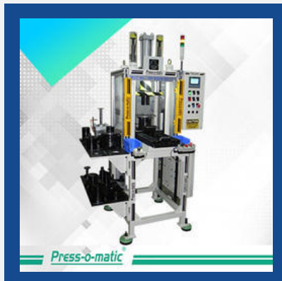
Multi Fixture Multi Purpose SPM