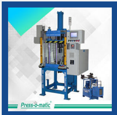
Hydraulic Pipe Forming Press