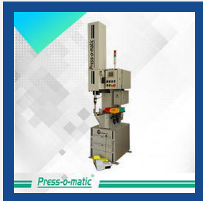
Riveting Press Machine