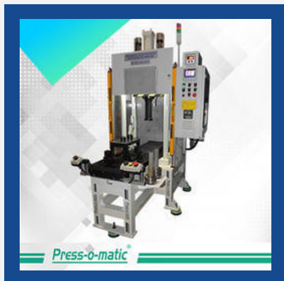
Shaft Bearing Assembly Press