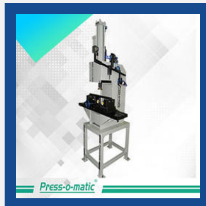
Hydro-Pneumatic Shaft Straightening Press Machine