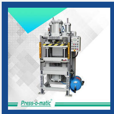
Dual Compression Coining Press