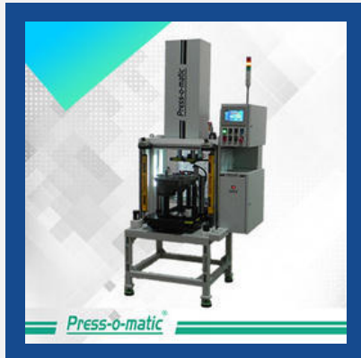
Differential Assembly Press Machine