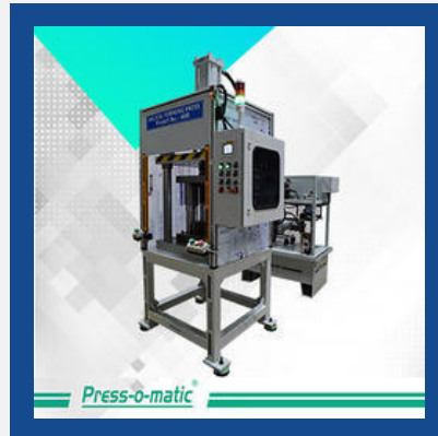
Hydraulic Helical Forming Press Machine